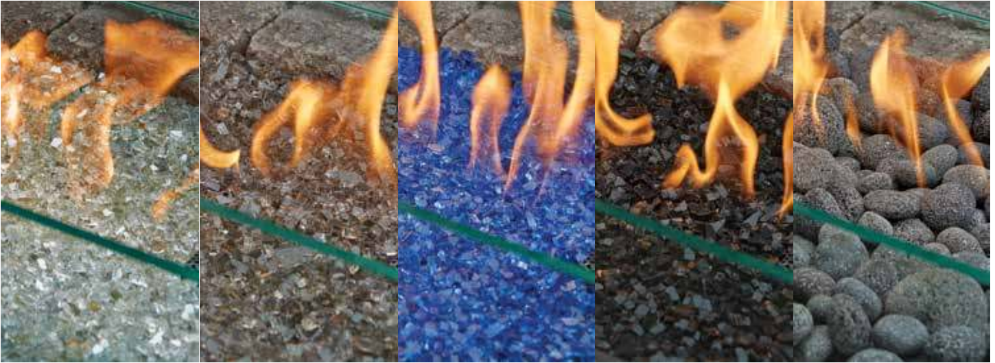
PLATINUM CRUSHED GLASS

Explore our extensive array of Crushed Glass and Stone medias. You're sure to discover the ideal match to the ambiance you seek to evoke in your personal Fire Garden. Available for all models except the 4035 Traditional Gas Fireplace, and Tempest Torches & Lanterns.