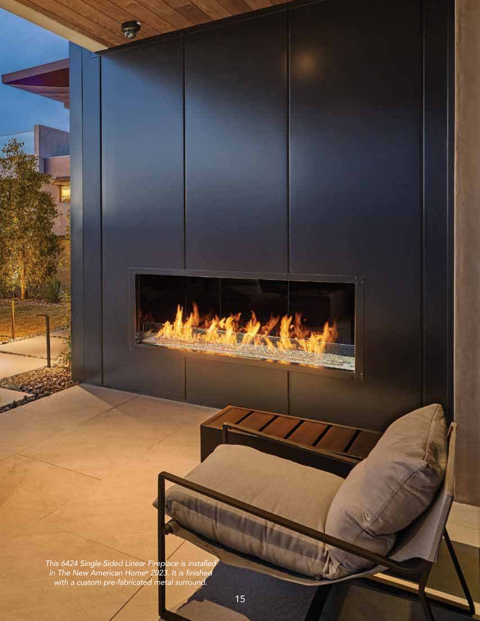
This 6424 Single-Sided Linear Fireplace is installed in The New American Home® 2023. It is finished with a custom pre-fabricated metal surround.