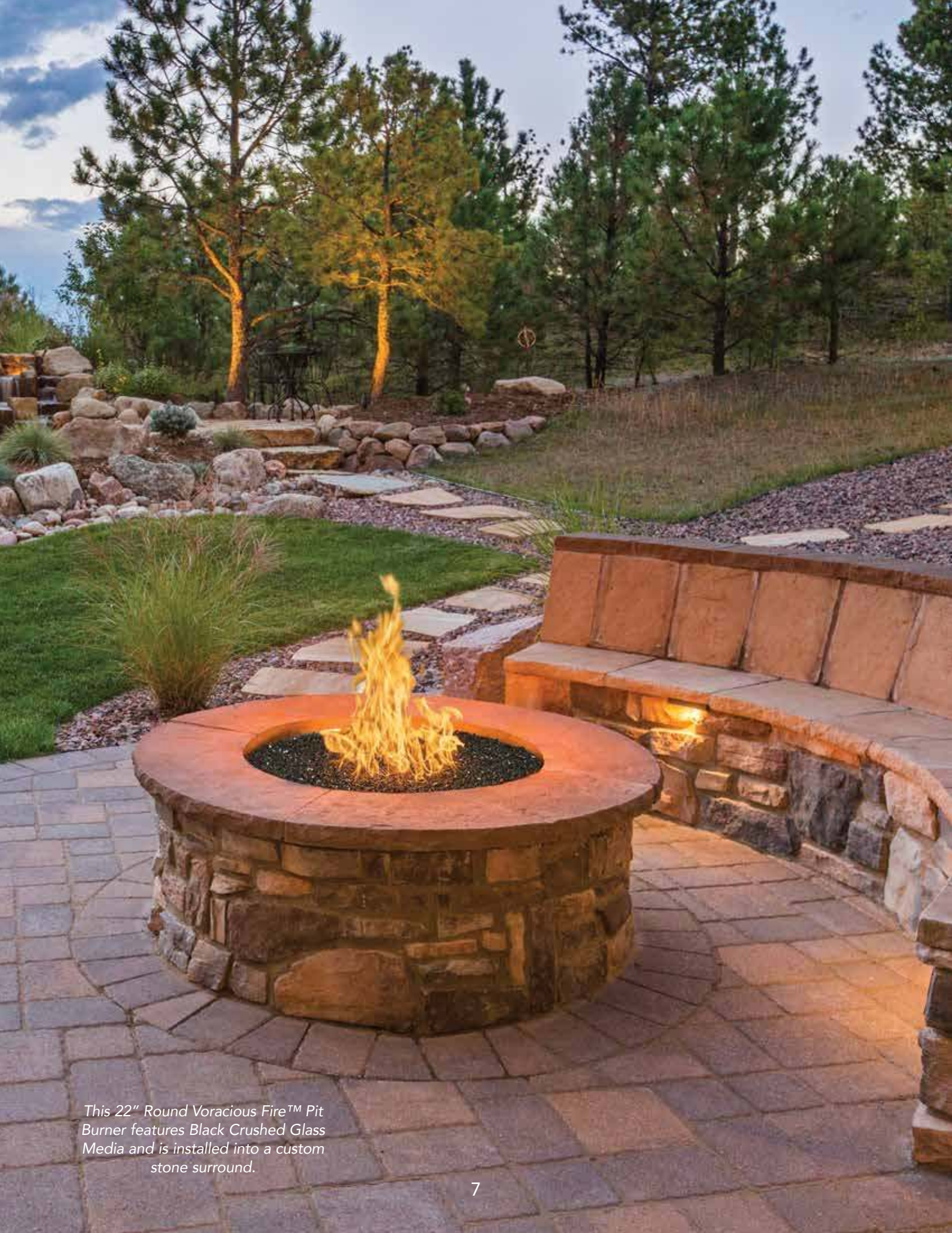
This 22" Round Voracious Fire™ Pit Burner features Black Crushed Glass Media and is installed into a custom stone surround.