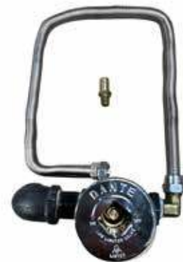
Hard Pipe Kit - NG/LP