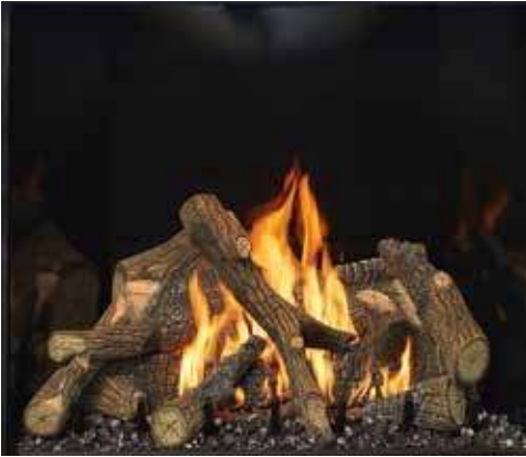
Oak Log Set