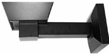
LANTERN WALL MOUNT