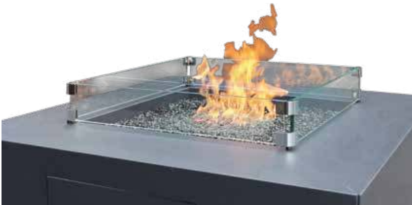
3/8" Glass Wind Guard