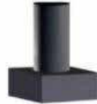
PILLAR MOUNT 3" x 11"