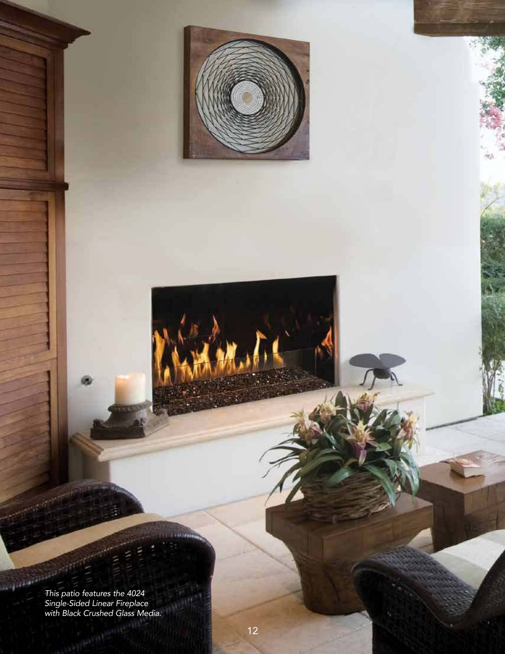
This patio features the 4024 Single-Sided Linear Fireplace with Black Crushed Glass Media.