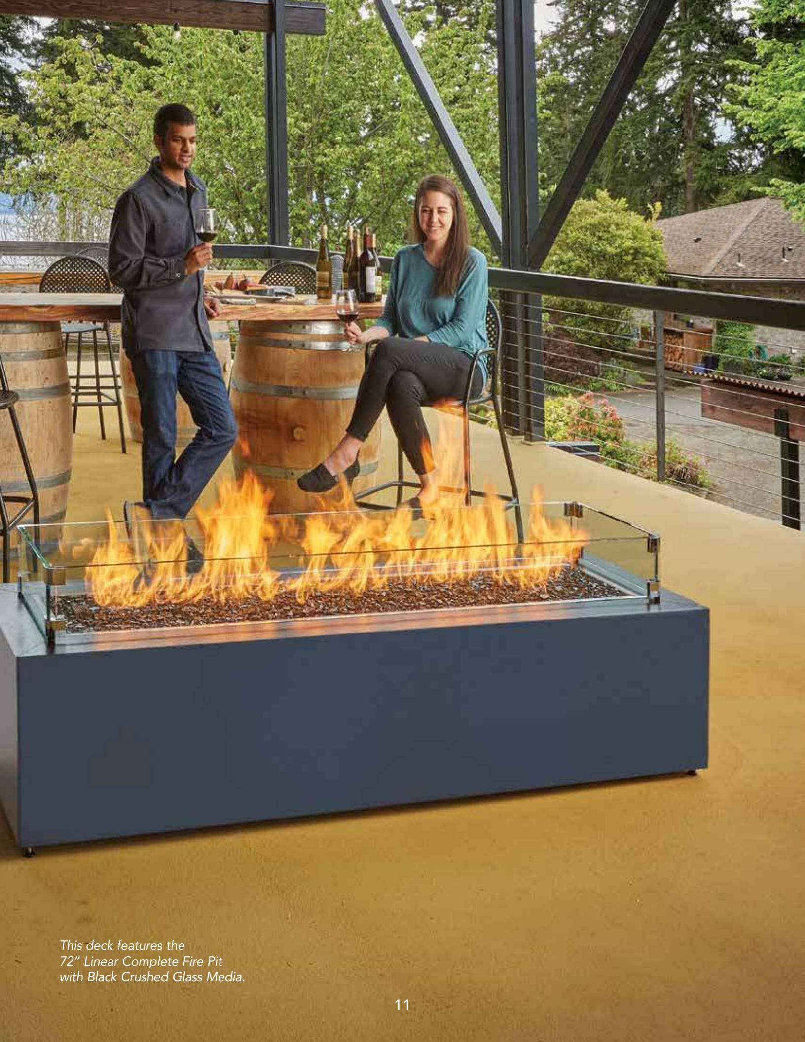
This deck features the 72" Linear Complete Fire Pit with Black Crushed Glass Media.