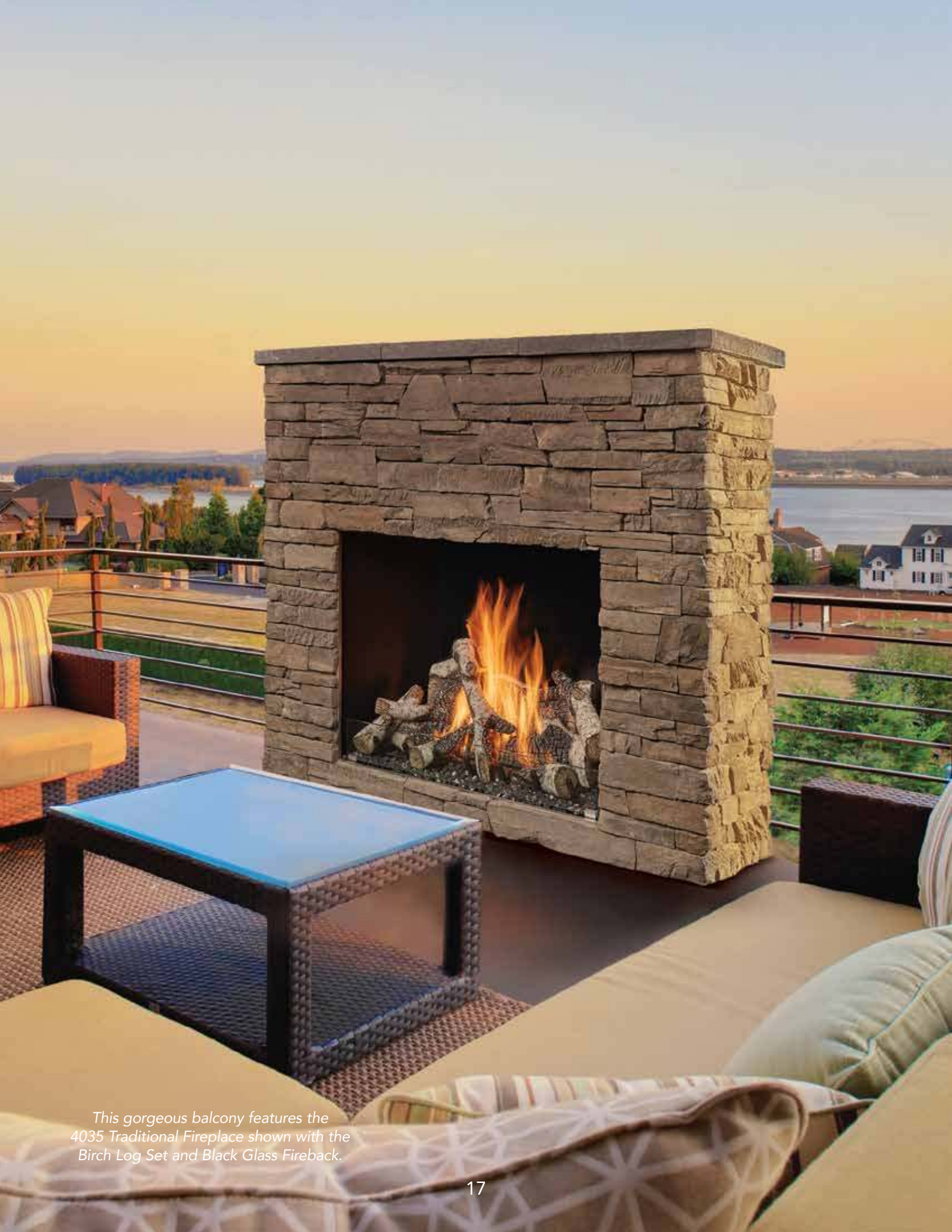
This gorgeous balcony features the 4035 Traditional Fireplace shown with the Birch Log Set and Black Glass Fireback.