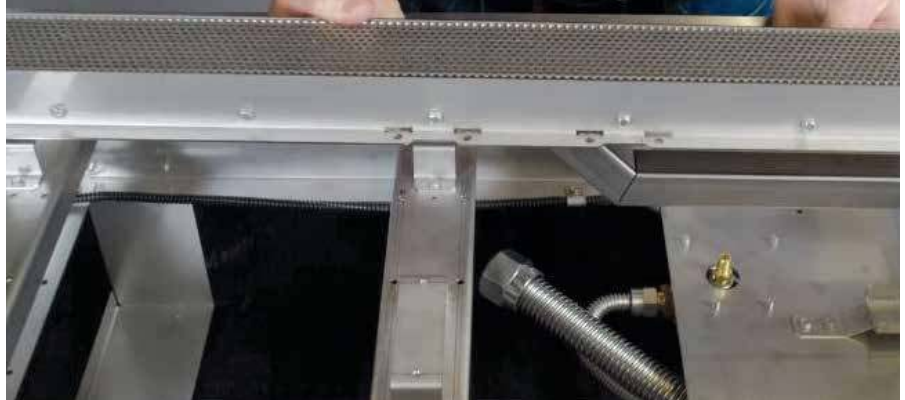
Above: A closer look at the heavy-duty stainless steel construction of our Linear Fire Pit Burner

is resistant to corrosion, heat, and weather elements, ensuring long-lasting performance and peace of mind.