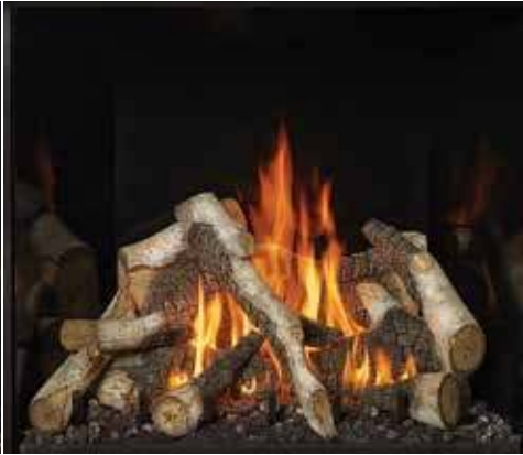
Birch Log Set