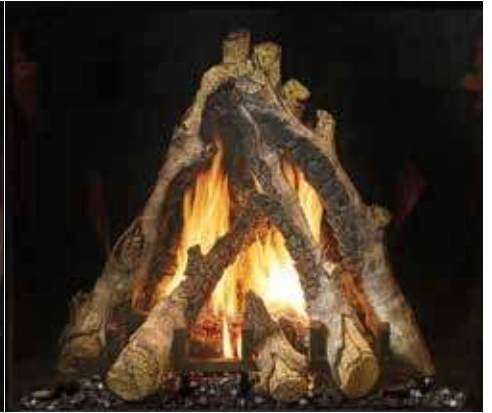
Bon-Fyre™ Birch Log Set